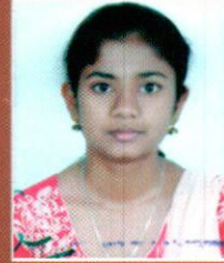
Uma .P 86.16%